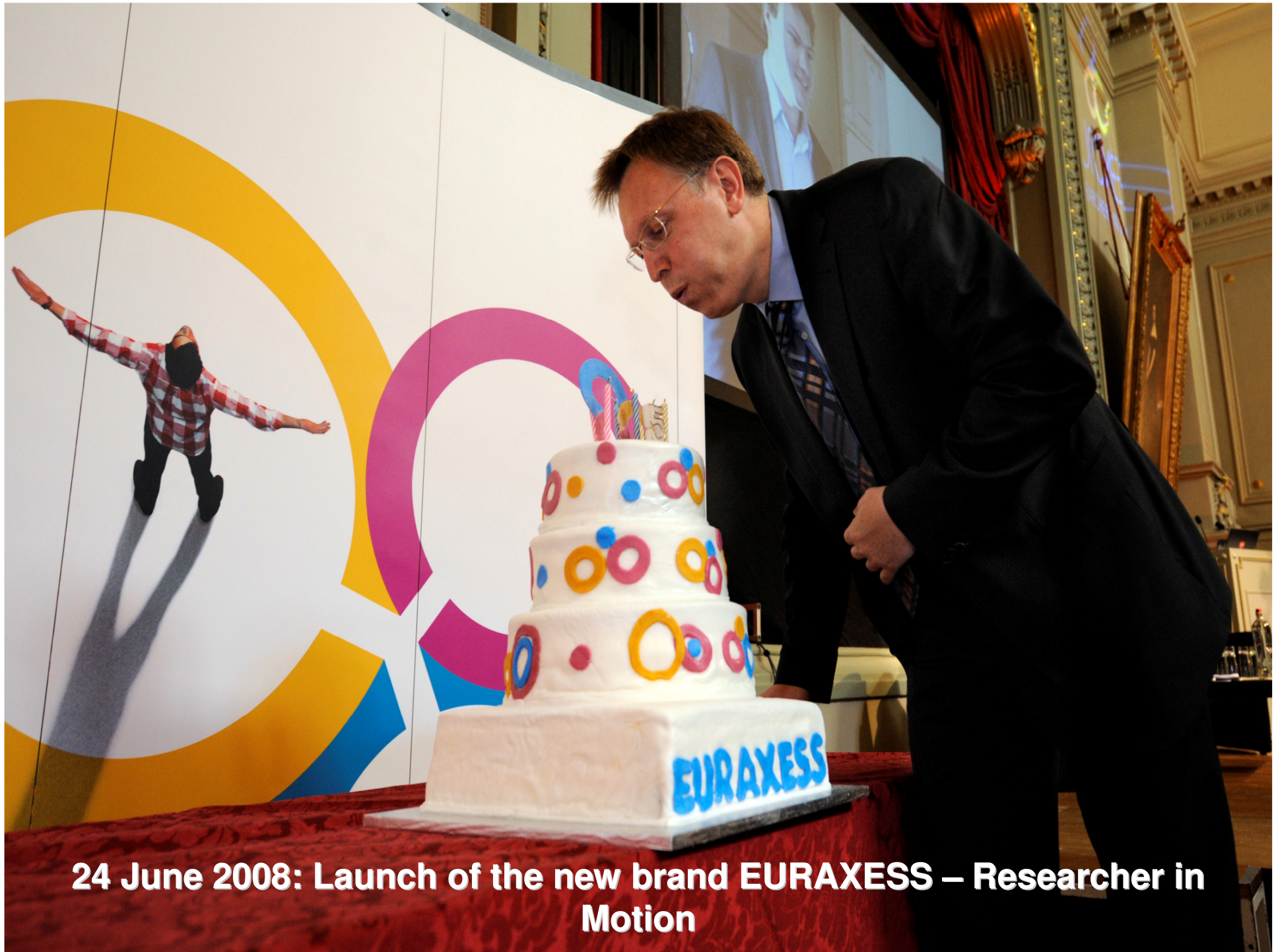
24 June 2008: Launch of the new brand EURAXESS – Researcher in Motion