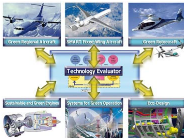
Figure 1: Clean Sky six Integrated Technology Demonstrators and the Technology Evaluator

In order to quantify the performance of the different ITDs, a Technology Evaluator will be developed.