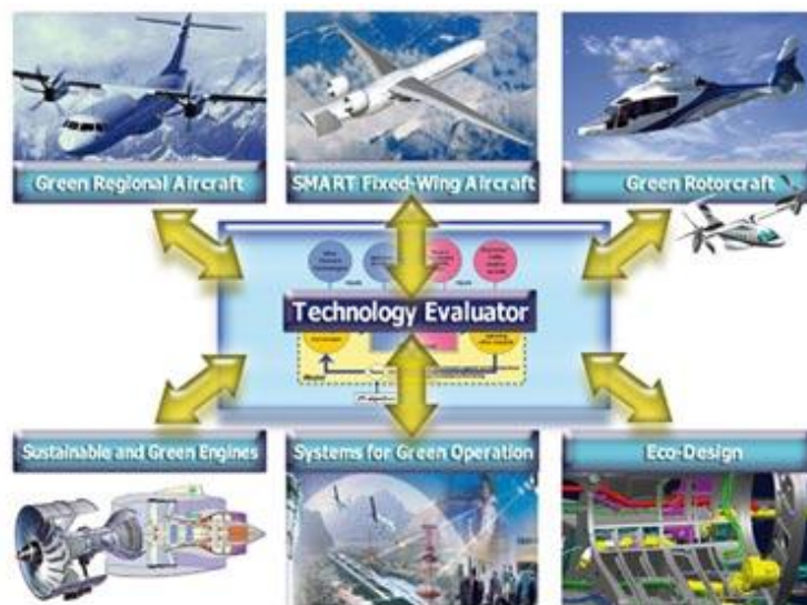
Figure 1: Clean Sky six Integrated Technology Demonstrators and the Technology Evaluator

In order to quantify the performance of the different ITDs, a Technology Evaluator will be developed.