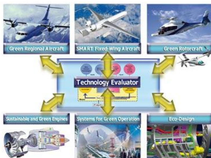
Figure 1: Clean Sky six Integrated Technology Demonstrators and the Technology Evaluator

In order to quantify the performance of the different ITDs, a Technology Evaluator will be developed.