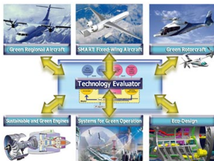
Figure 1: Clean Sky six Integrated Technology Demonstrators and the Technology Evaluator

In order to quantify the performance of the different ITDs, a Technology Evaluator will be developed.